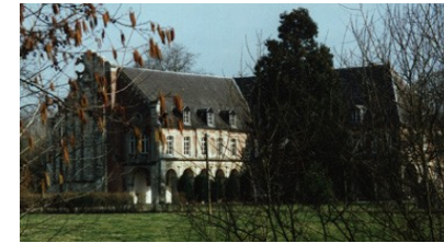
Abbaye st Nicolas

Come to visit abbay Saint Nicolas, church Saint-Pierre-et-Saint-Paul, statue of Antoine Nicolas de Condorcet and his birth place . Ribemont is famous for this man, who was a philosopher and mathematician.