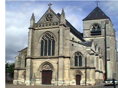
Church St Pierre St Paul