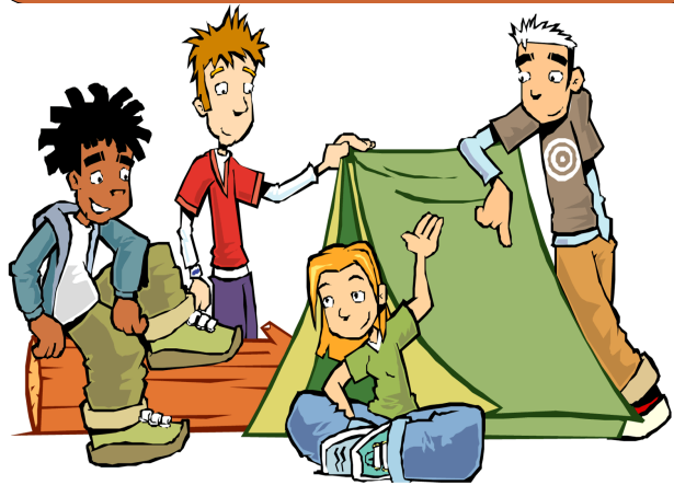
If you love nature, why don't you sleep under ther stars ?