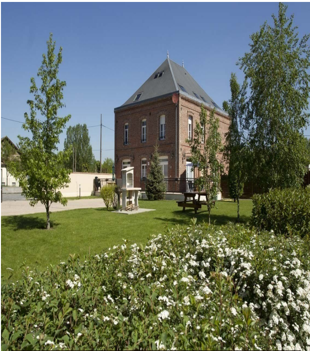
This is the holiday cottage "Le Relais Fleuri". So if you want to visit Ribemont, you can stay there.